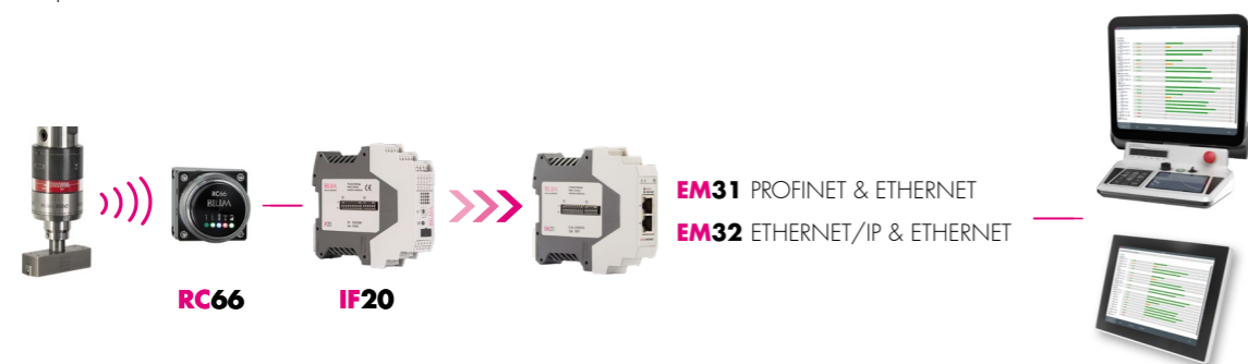
System configuration depends on application

Because of its platform-independent design, this measurement software can be installed directly on the control's HMI. Depending on the existing control configuration, the software may not need to be installed on an additional measurement computer.